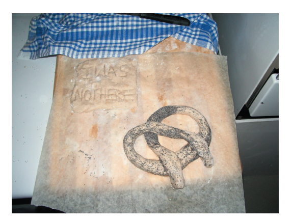
Bretzel or Pretzel? Just eat it..