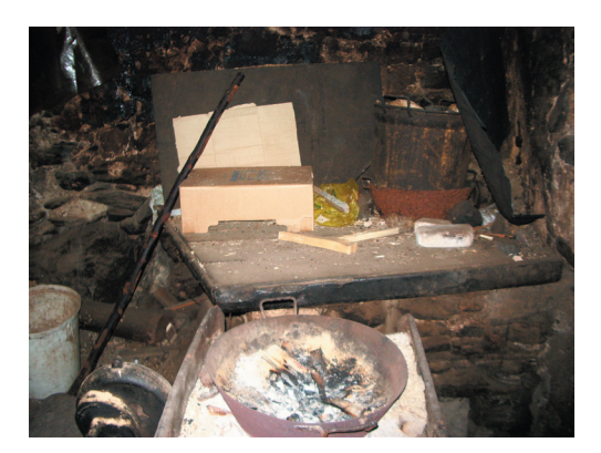
The Gamper family's old house with a bread oven.v