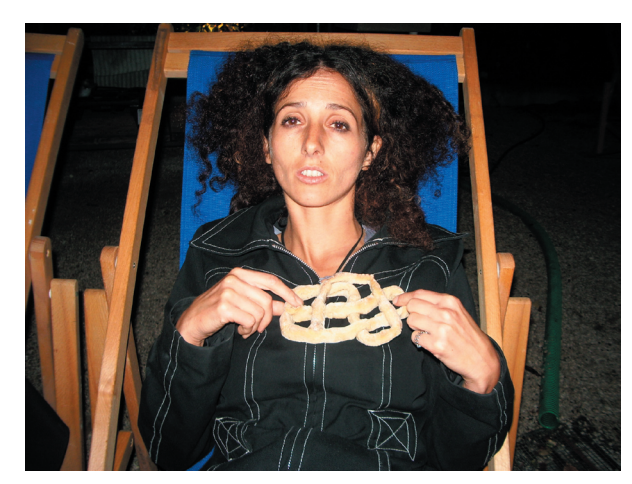
Making. Eating. Sharing.