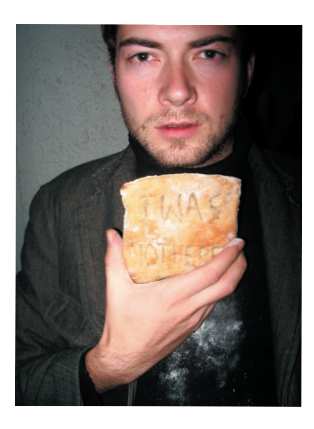
Some bread communication