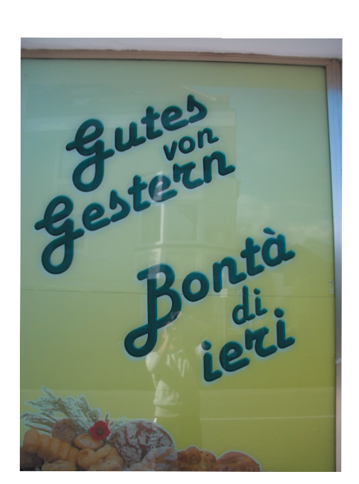
Bread recycling. Selling cheaper the bread from the previous day.