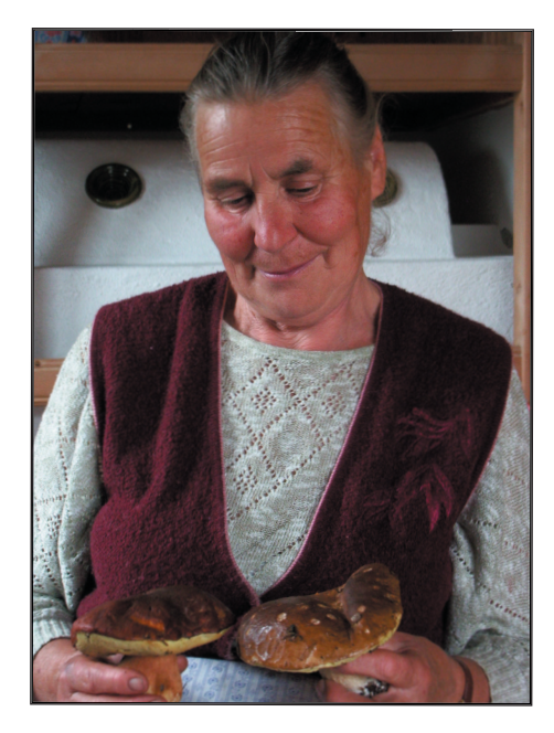
Martino's aunt with some of the mushrooms she found on the same day.