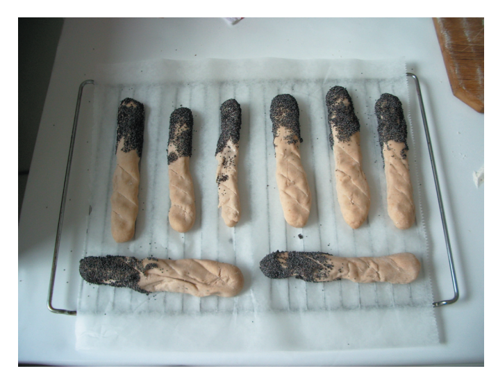
Some of the Baguettes Magiques ready to cook.