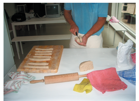
Making bread during the private view at Lungomare.